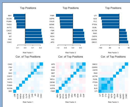
FIGURE 2: Factor mimicking portfolios from multifactor models